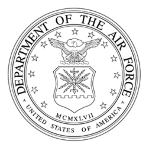
Figure A2.1. Department of the Air Force Seal.

A2.1.2. AFPAA approves use of facsimiles of the seal. This includes use on insignia, flags, medals, and similar items. AFPAA also approves industry or AF groups request for use of other parts of the seal.